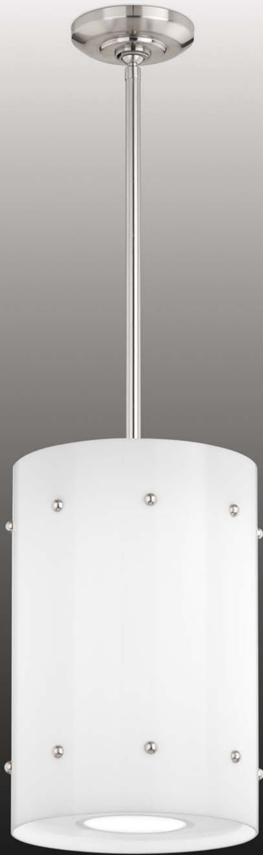
profile series P1128 acrylic diffuser