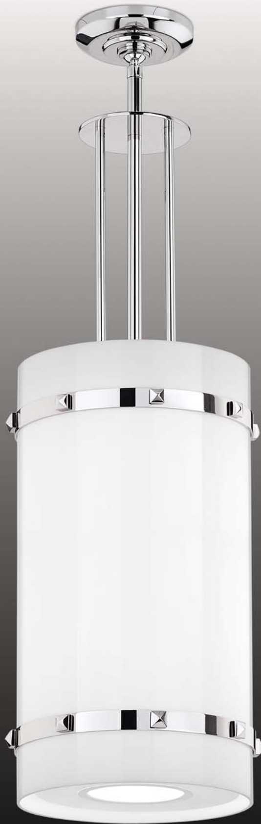
elements series P2178 acrylic diffuser