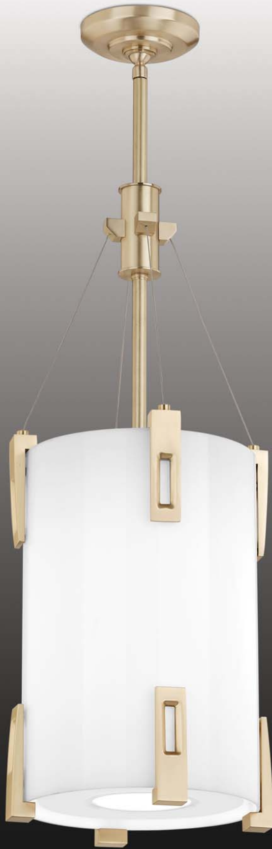
signature series P3129 acrylic diffuser