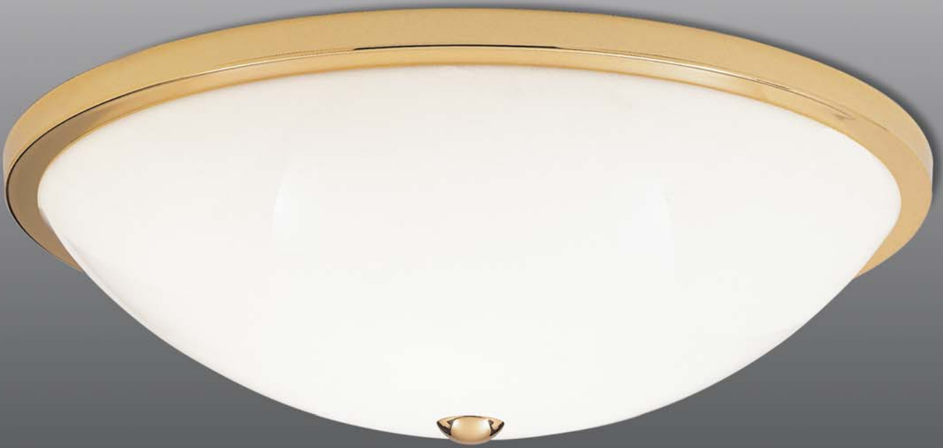
profile series C1110 acrylic diffuser C1111 - C1115