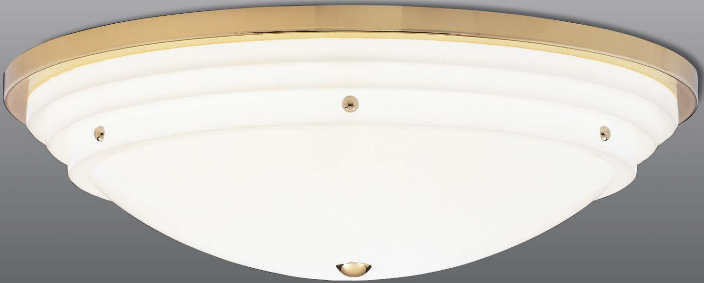
profile series C1130 acrylic diffuser