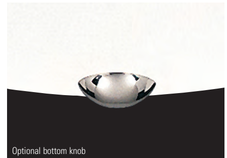
Optional bottom knob

Consult technical section for photometric reports. Davis/Muller will gladly run photometric reports for your application at no cost or obligation. Ask your sales representative for details.