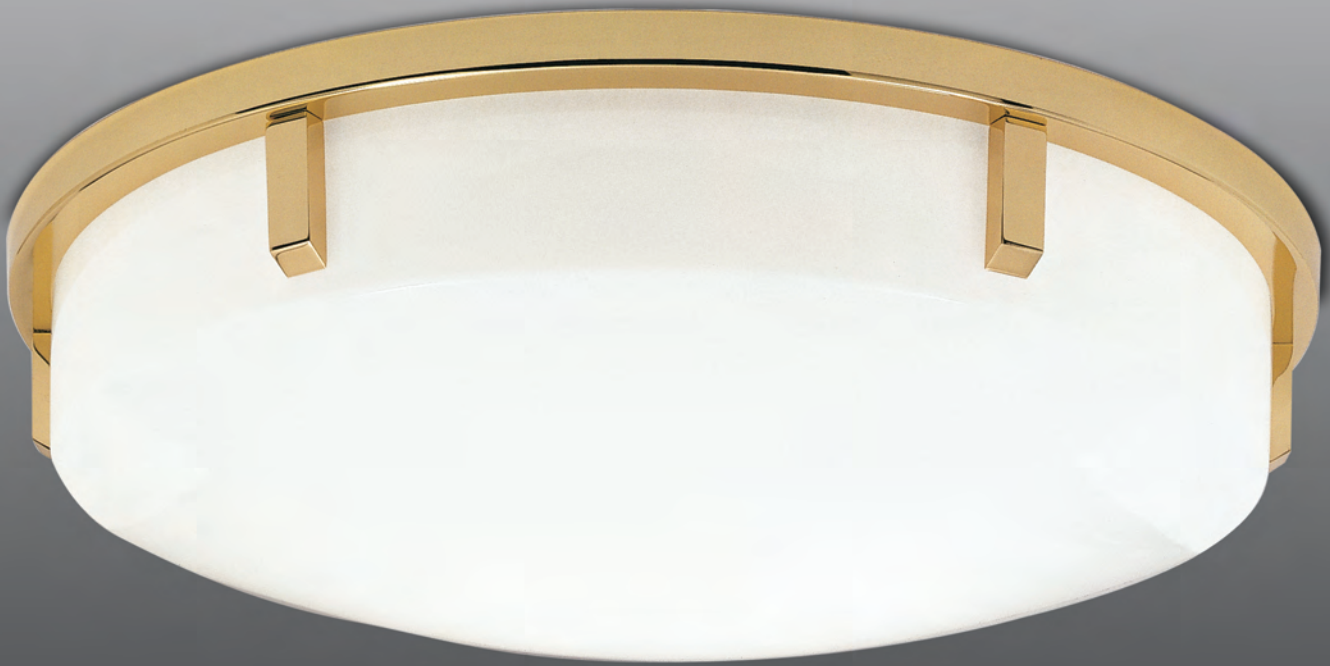
elements series C2160 acrylic diffuser