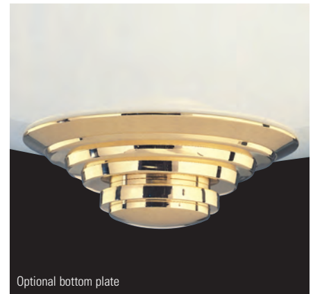
Optional bottom plate

Consult technical section for photometric reports. Davis/Muller will gladly run photometric reports for your application at no cost or obligation. Ask your sales representative for details.