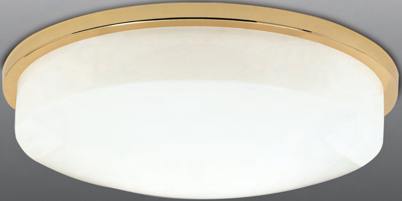
elements series C2165 acrylic diffuser