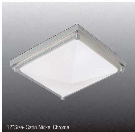
12" Size- Satin Nickel Chrome