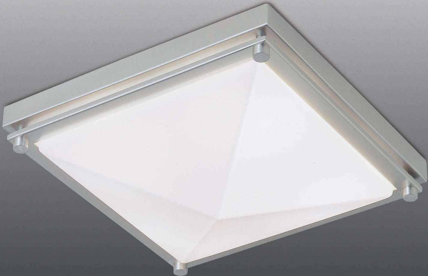
elements series C2215 acrylic diffuser