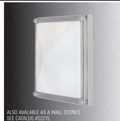
ALSO AVAILABLE AS A WALL SCONCE SEE CATALOG #S2215

Consult technical section for photometric reports. Davis/Muller will gladly run photometric reports for your application at no cost or obligation. Ask your sales representative for details.