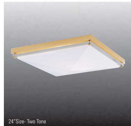
24" Size- Two Tone