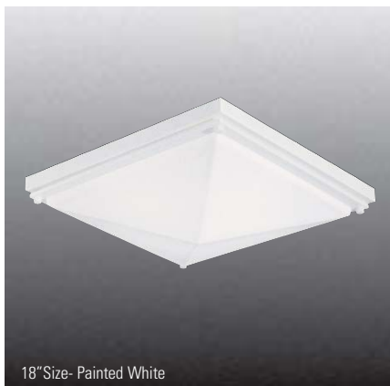
18" Size- Painted White