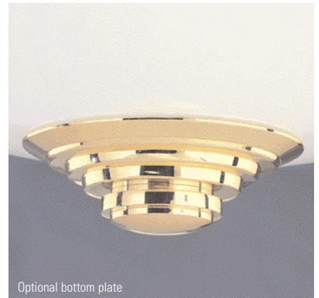
Optional bottom plate

Consult technical section for photometric reports. Davis/Muller will gladly run photometric reports for your application at no cost or obligation. Ask your sales representative for details.