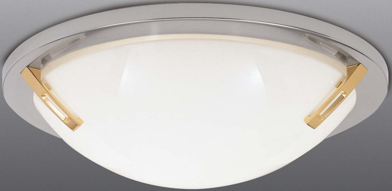
signature series C3120 acrylic diffuser