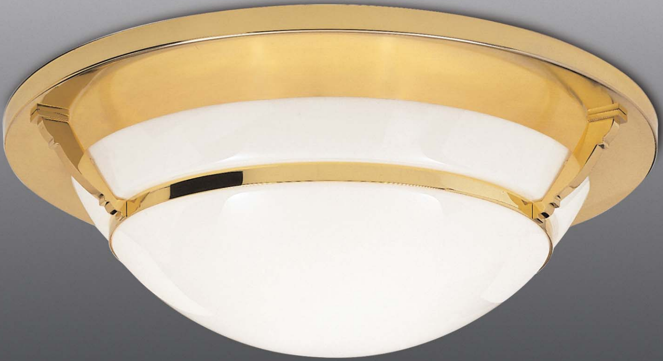
signature series C3150 acrylic diffuser