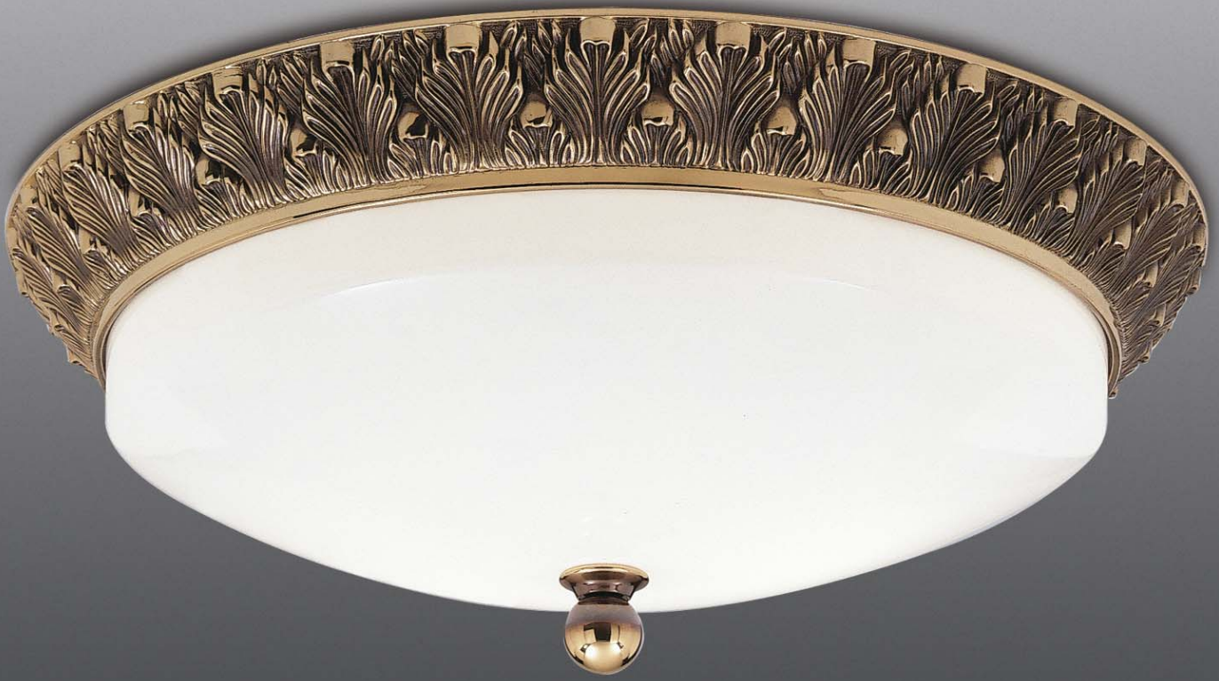
signature series C3160 acrylic diffuser