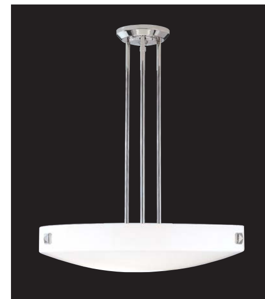
SMALL ROUND BUTTONS 6 PER FIXTURE