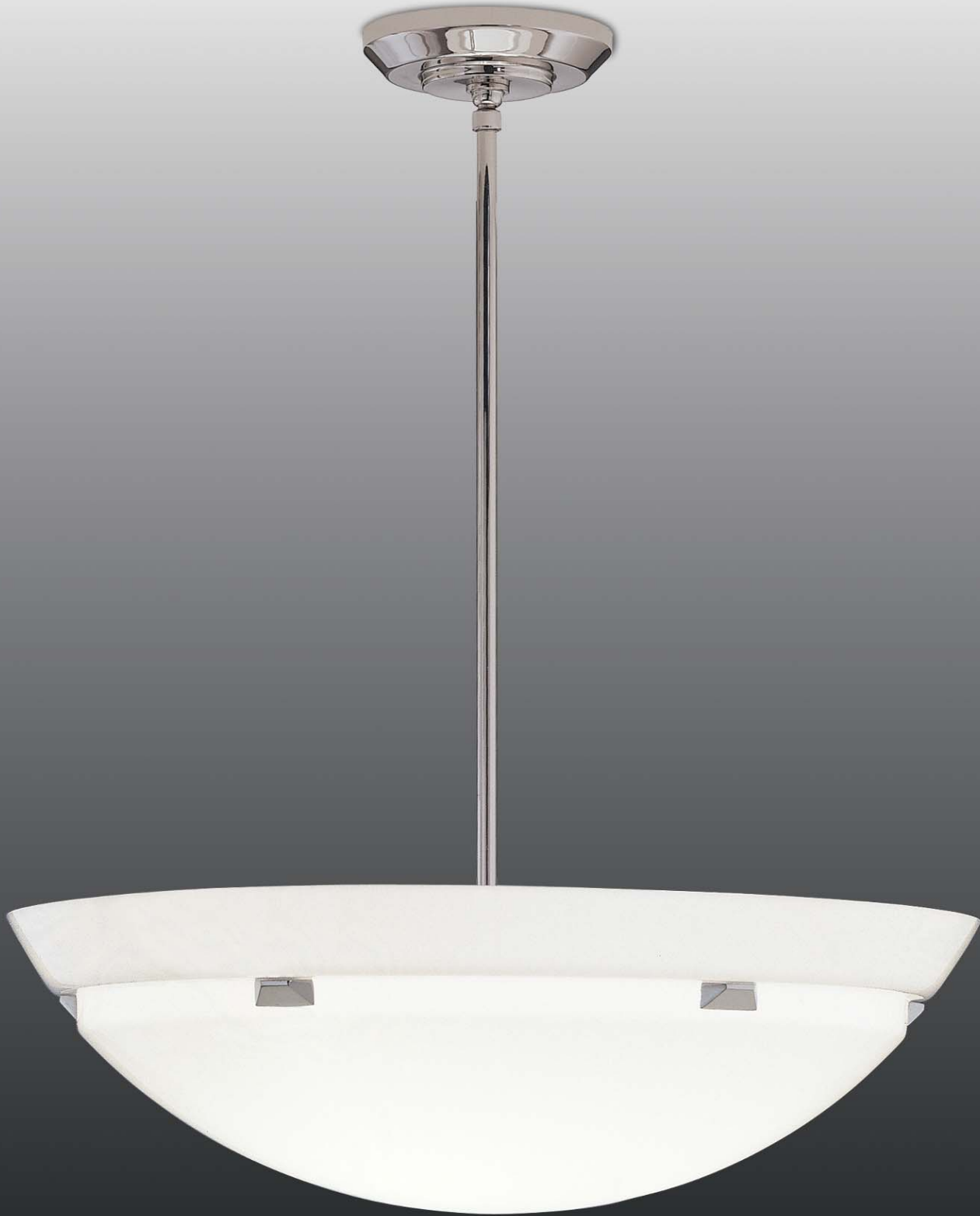
profile series P1140 acrylic diffuser