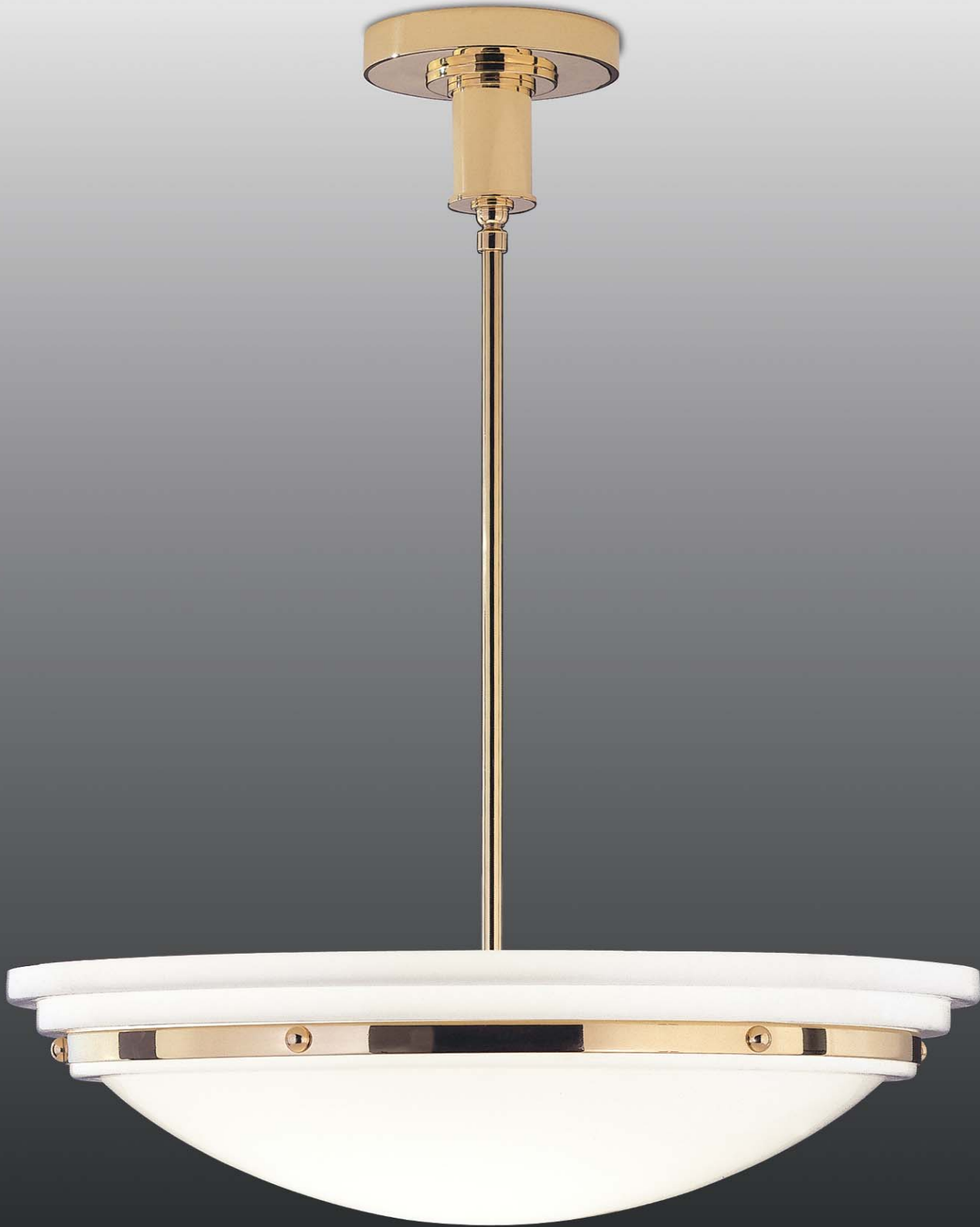
elements series P2170 acrylic diffuser