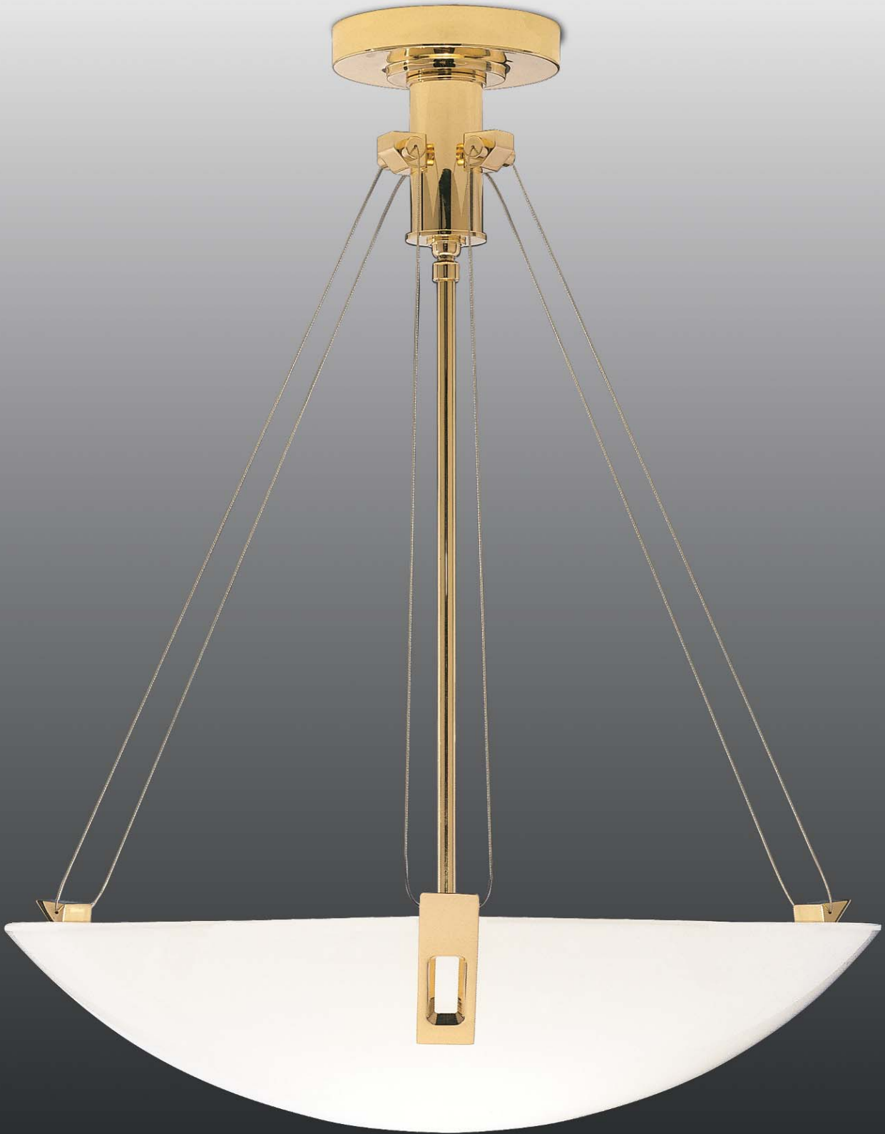
signature series P3120 acrylic diffuser