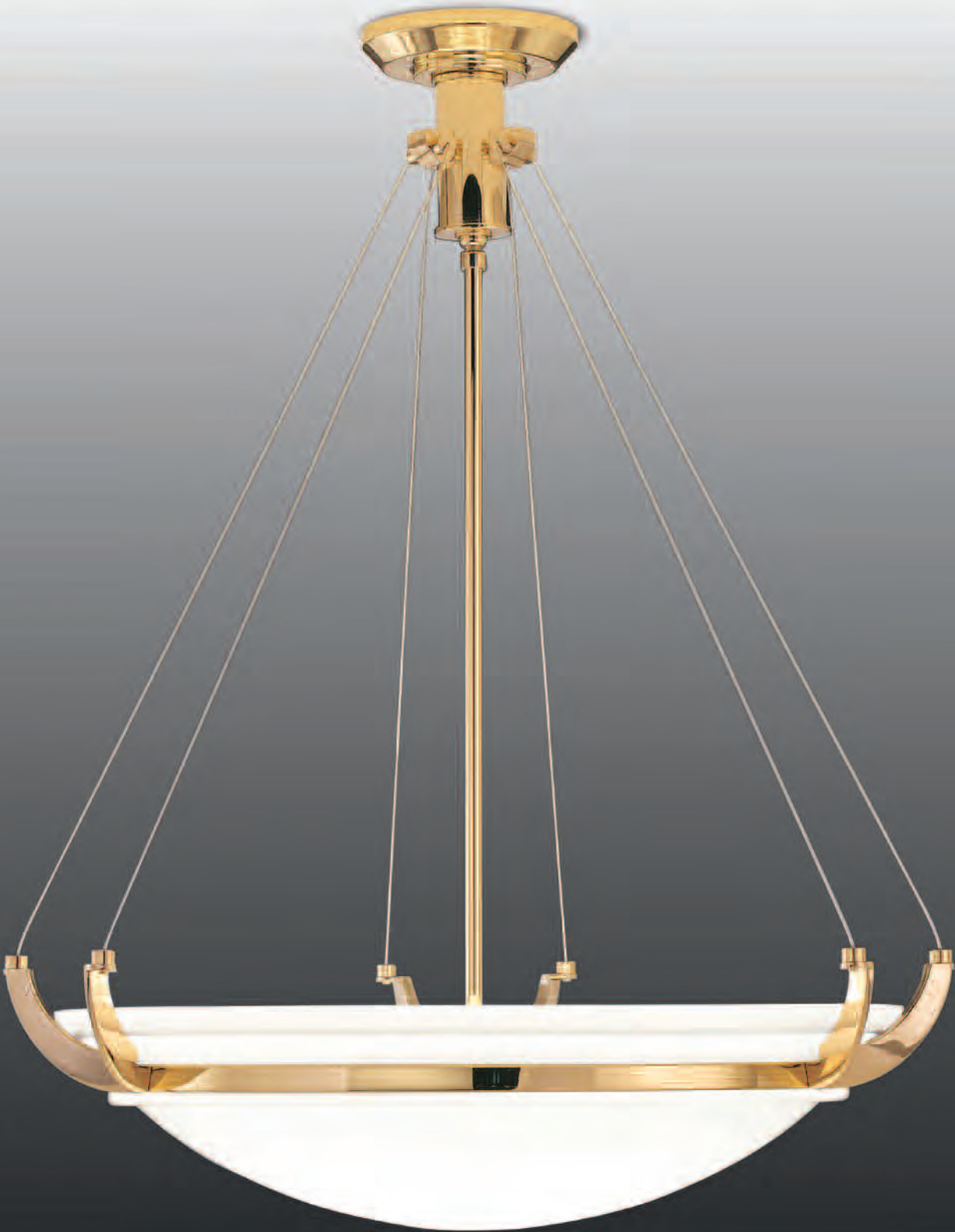
signature series P3130 acrylic diffuser