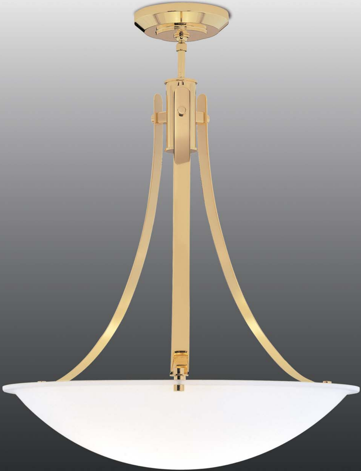
profile series P7110 glass diffuser