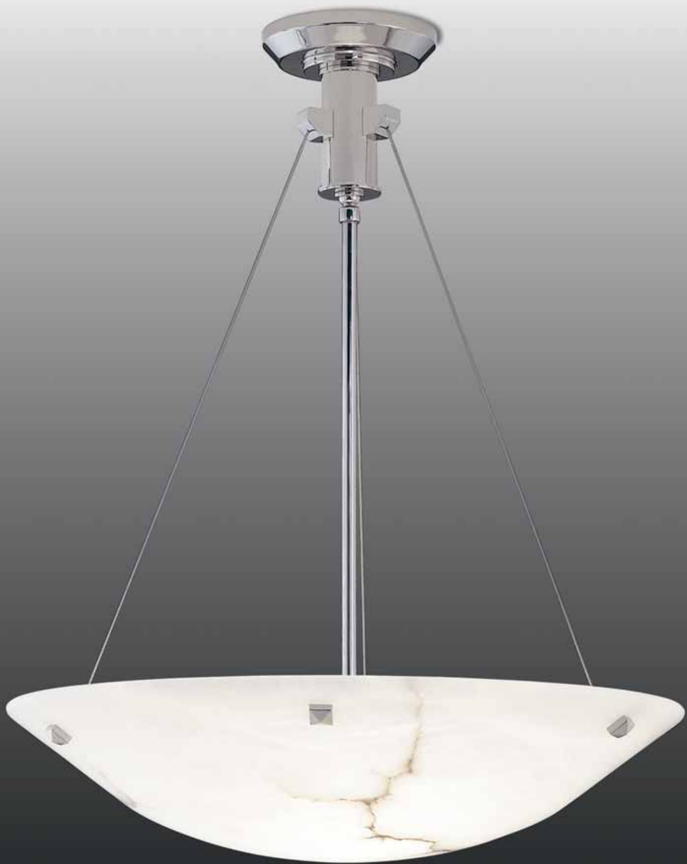
profile series P8110 faux alabaster diffuser