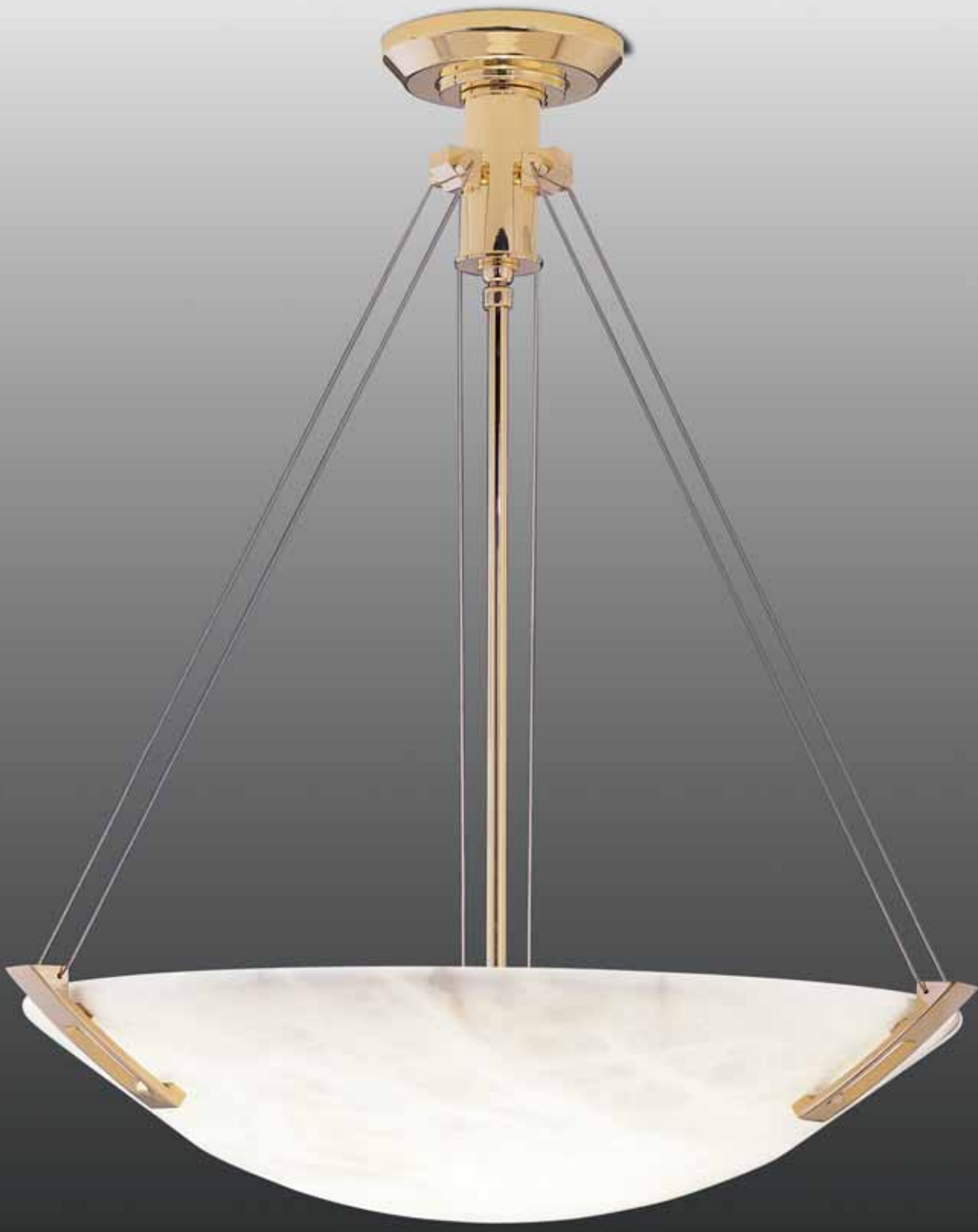
signature series P8320 faux alabaster diffuser