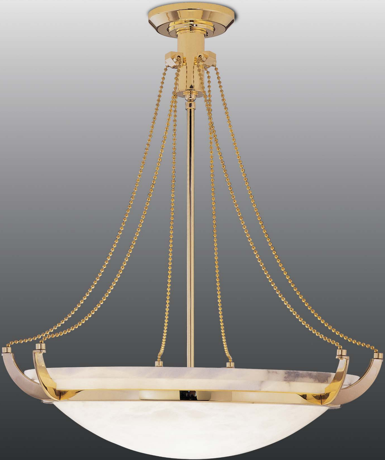
signature series P8330 alabaster diffuser