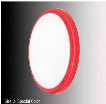
Size 2- Special Color