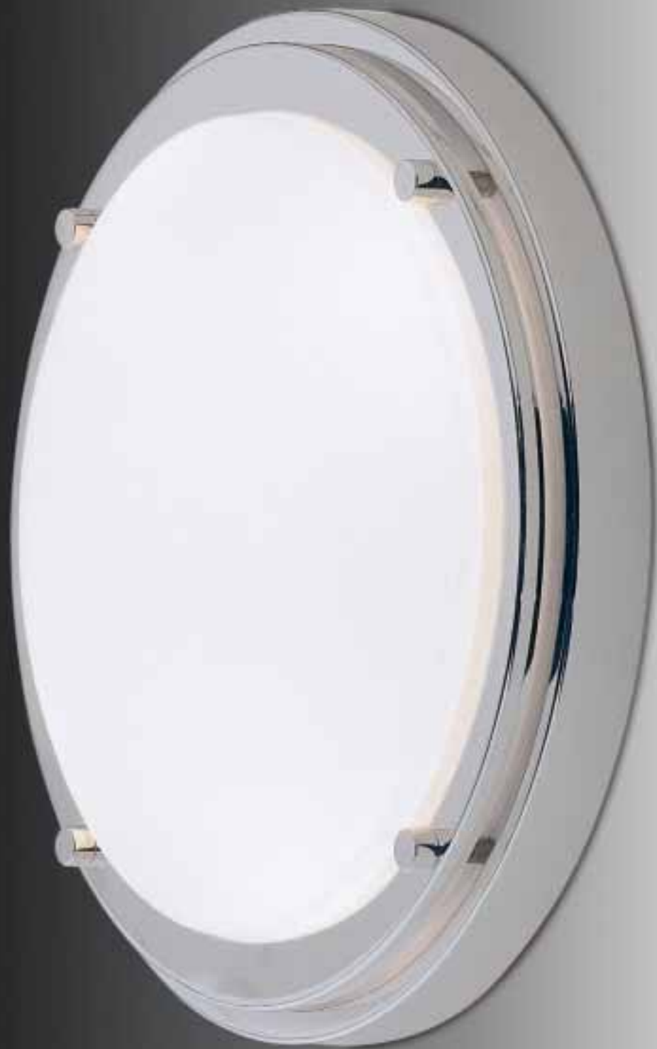
elements series S2210 ovale diffusor