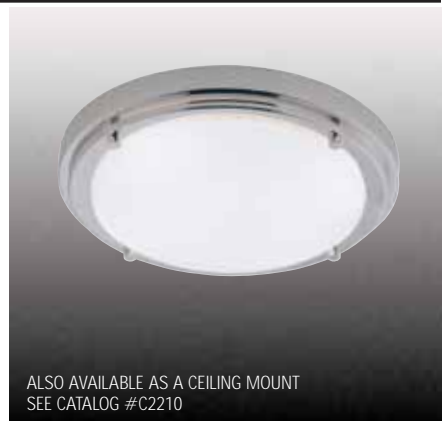
ALSO AVAILABLE AS A CEILING MOUNT SEE CATALOG #C2210

Consult technical section for photometric reports. Davis/Muller will gladly run photometric reports for your application at no cost or obligation. Ask your sales representative for details.