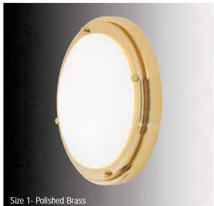
Size 1- Polished Brass