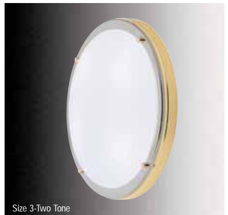
Size 3- Two Tone