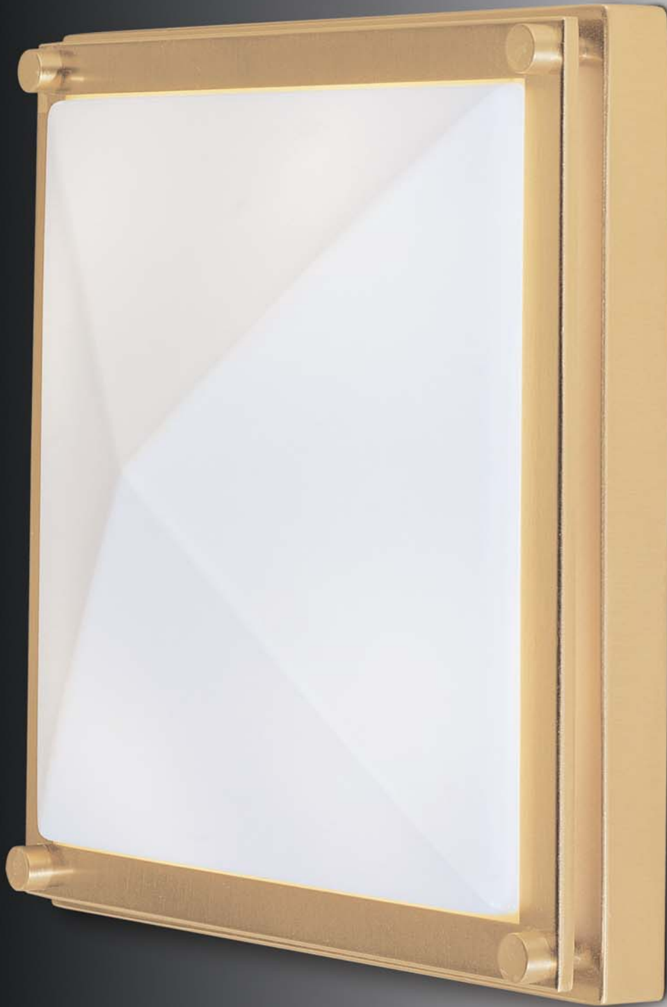
elements series S2215 acrylic diffuser