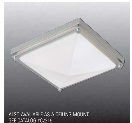
ALSO AVAILABLE AS A CEILING MOUNT SEE CATALOG #C2215

Consult technical section for photometric reports. Davis/Muller will gladly run photometric reports for your application at no cost or obligation. Ask your sales representative for details.