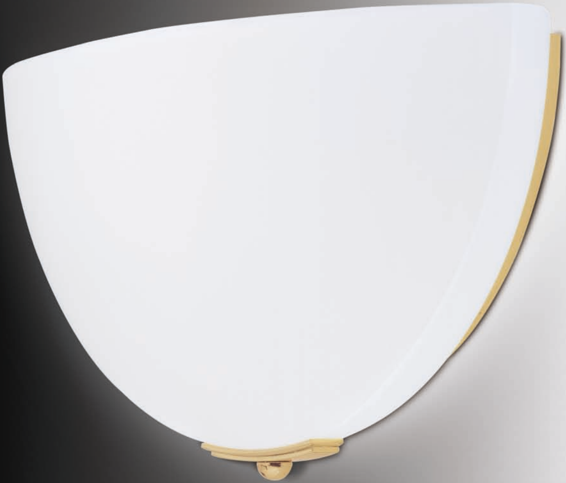
profile series S4110 acrylic diffuser