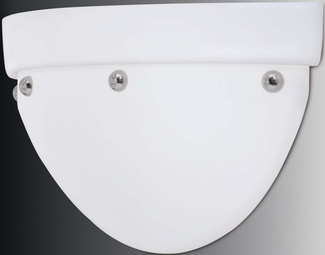
profile series S4150 acrylic diffuser