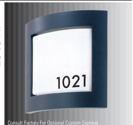
Consult Factory For Optional Custom Signage

Consult technical section for photometric reports. Davis/Muller will gladly run photometric reports for your application at no cost or obligation. Ask your sales representative for details.