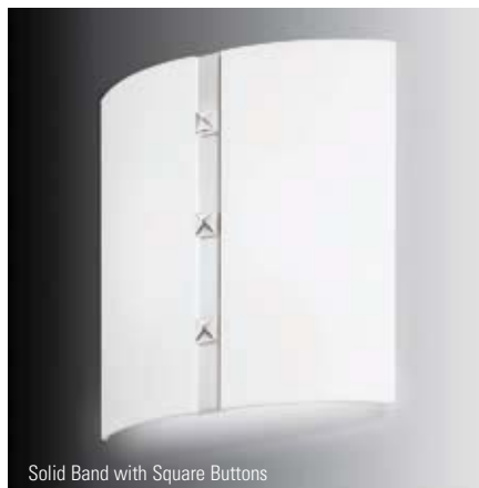
Solid Band with Square Buttons