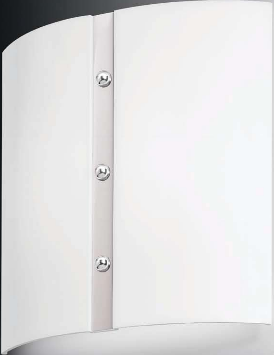
elements series S5210 acrylic diffuser