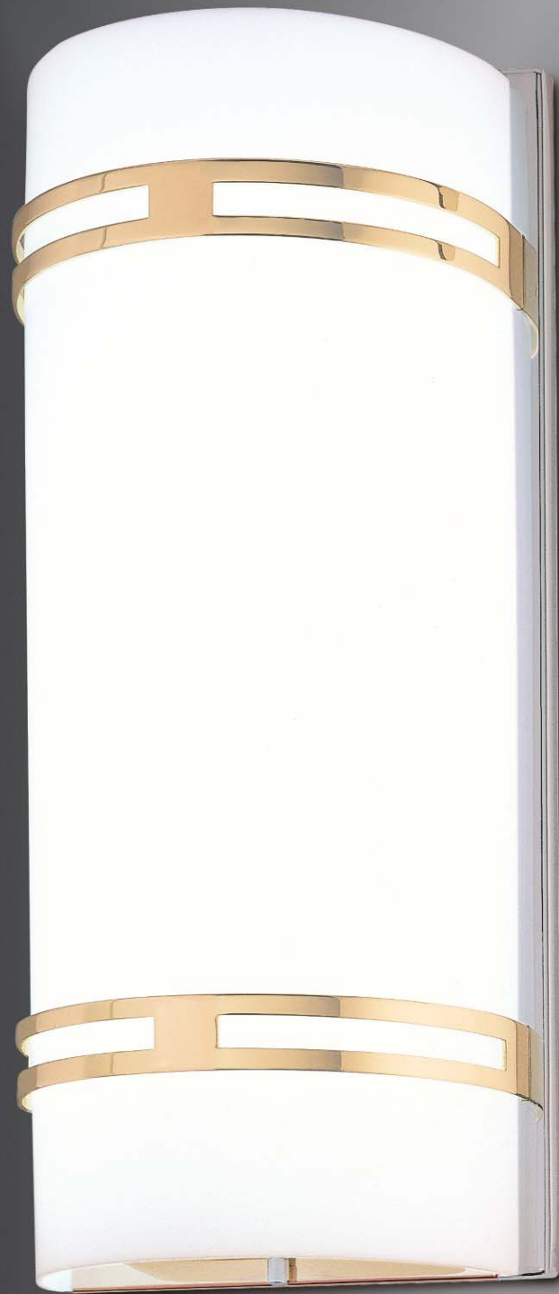
elements series S5310 acrylic diffuser