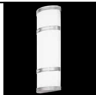
Fixtures may also be mounted vertically.

Consult technical section for photometric reports. Davis/Muller will gladly run photometric reports for your application at no cost or obligation. Ask your sales representative for details.