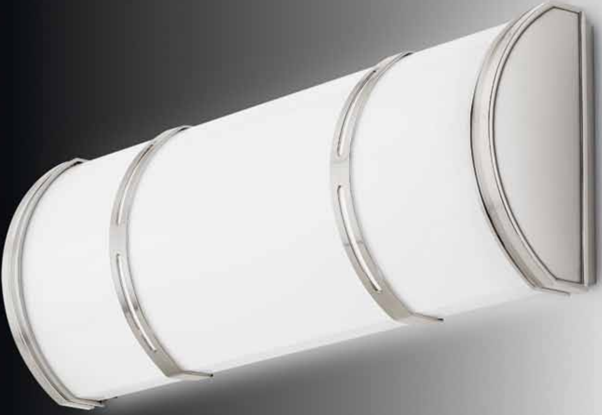
elements series S5355 acrylic diffuser