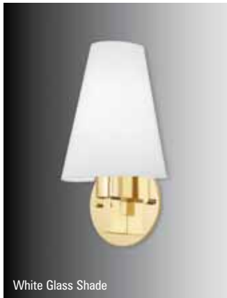
White Glass Shade