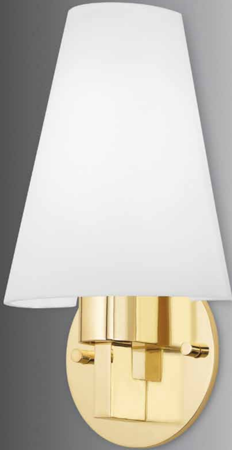
elements series S5750 white glass shade